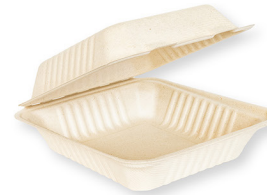
8"X8"X3" CLAMSHELL 200/CASE NF-88-CS