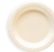
6" PLATE 1000/CASE NF-6PR