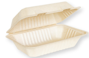
9"X6"X3" CLAMSHELL 250/CASE NF-963-CS