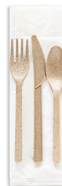
CUTLERY SLEEVE NATURAL 200/CASE NATS