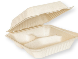
8"X8"X3" CLAMSHELL 3-COMPARTMENT 200/CASE NF-883C-CS