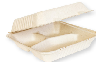
9"X9"X3" CLAMSHELL 3-COMPARTMENT 200/CASE NF-993C-CS