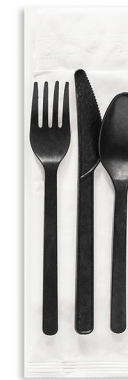
CUTLERY SLEEVE BLACK 200/CASE BATS