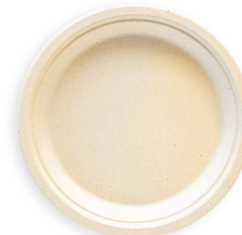
9" PLATE 500/CASE NF-9PR