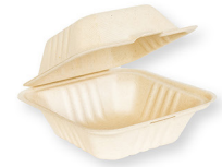
6"X6"X3" CLAMSHELL 500/CASE NF-66-CS