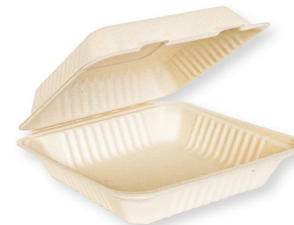
9"X9"X3" CLAMSHELL 200/CASE NF-99-CS